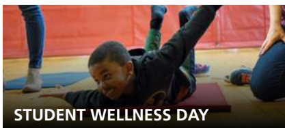
STUDENT WELLNESS DAY