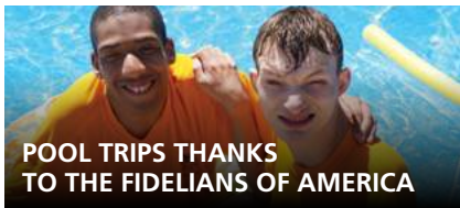
POOL TRIPS THANKS TO THE FIDELIANS OF AMERICA