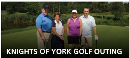
KNIGHTS OF YORK GOLF OUTING