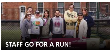
STAFF GO FOR A RUN!