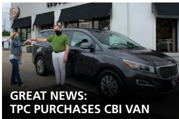
GREAT NEWS: TPC PURCHASES CBI VAN