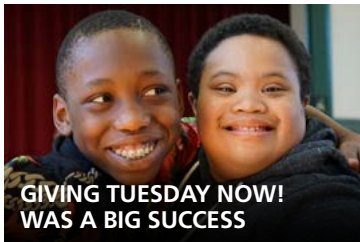
GIVING TUESDAY NOW! WAS A BIG SUCCESS