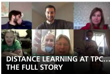
DISTANCE LEARNING AT TPC... THE FULL STORY