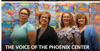
THE VOICE OF THE PHOENIX CENTER