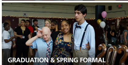
GRADUATION & SPRING FORMAL