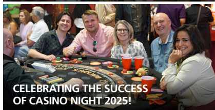
CELEBRATING THE SUCCESS OF CASINO NIGHT 2025!