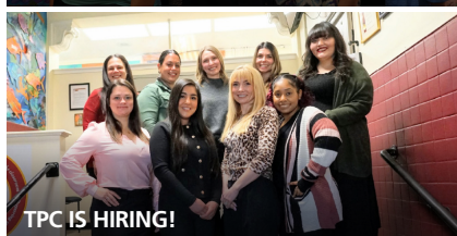
TPC IS HIRING!