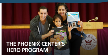
THE PHOENIX CENTER'S HERO PROGRAM